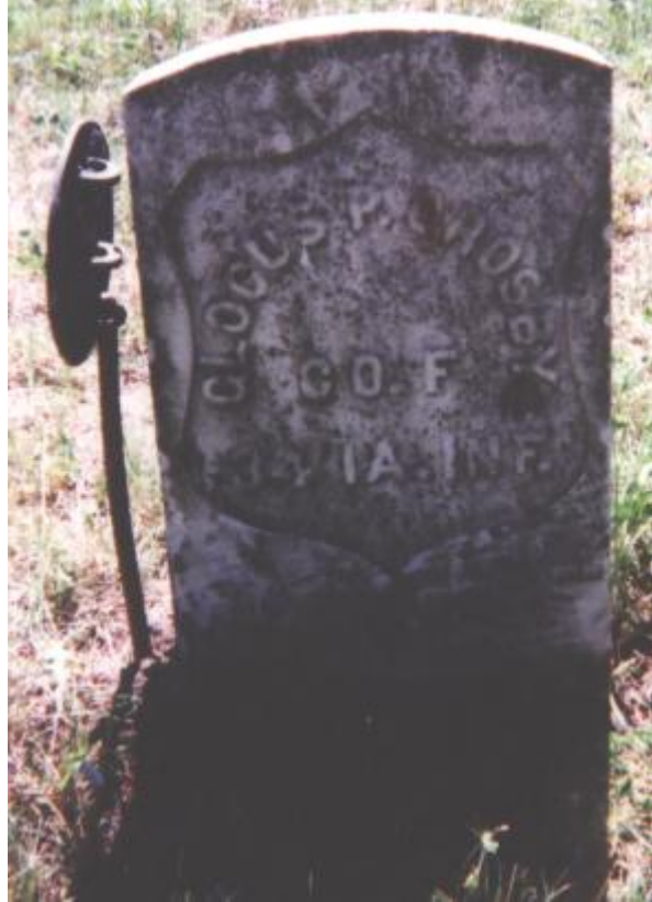
Glockus Crosby Co. F. 38 IA. INF.