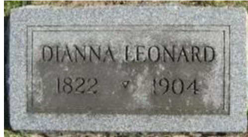
Buried Oak Shade Cemetery, Marion, Linn County, Iowa (Lot NW 1/4 10)