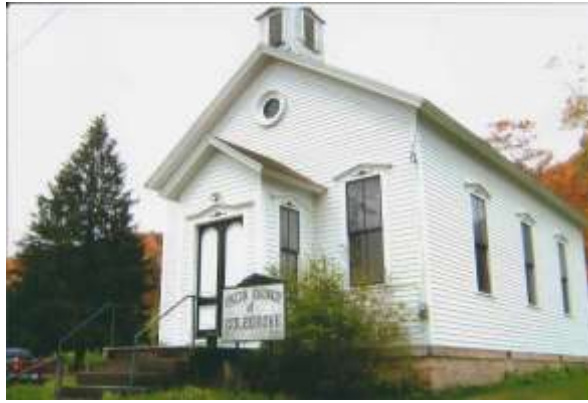
Union Church of Colegrove