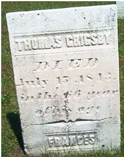
Thomas Grigsby died 15 July 1843 age 66