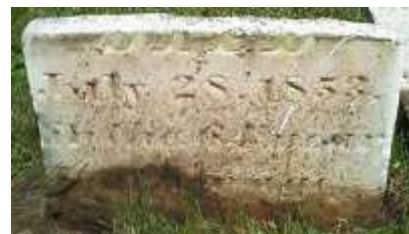
Frances (wife) 75 died 28 July 1853 age 64