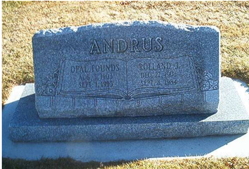
Opal Founds Andrus (Aug. 5, 1903 – Sept. 1, 1995) Rolland J. Andrus (Dec. 27, 1903 – Sept. 8, 1984)