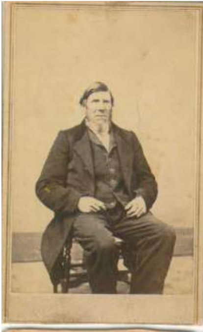
James Grigsby (1806 – 1874)