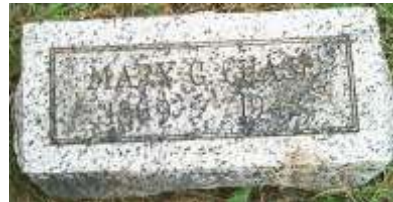
Mary G. Chase 1867-1948