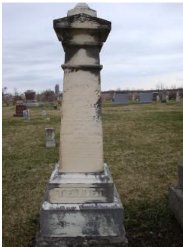
Henry R. Teller husband of Elizabeth H. b. Feb 23, 1824 Springfield, Clark County, OH d. Jun 3, 1886